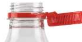
26 CSD, GME 30.37