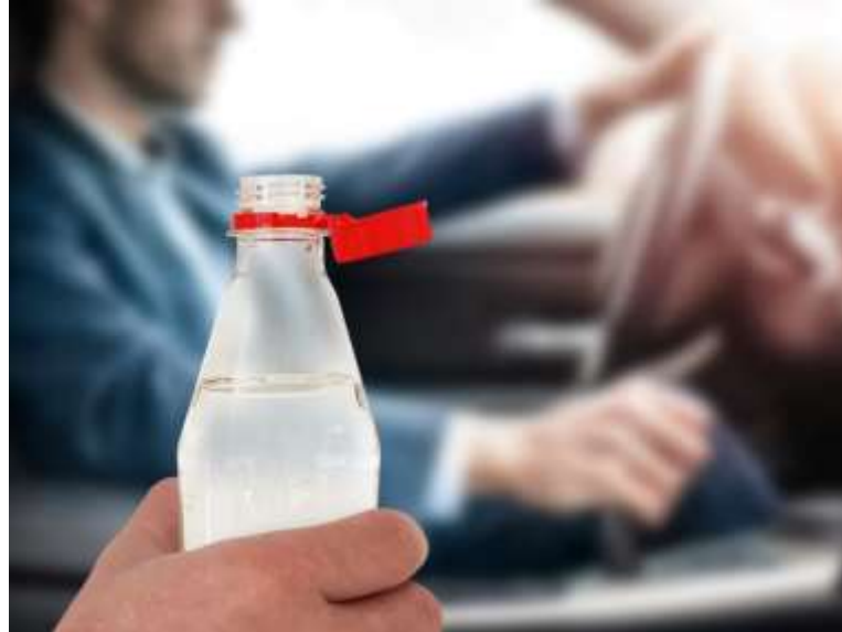
Comfortable Drinking On-the-Go → 1-hand opening, no lost caps