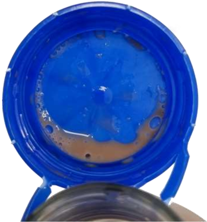
Without capillary ribs und “polished” HP surface

The Solution: BERICAP Capillary Ribs ! Patent Pending