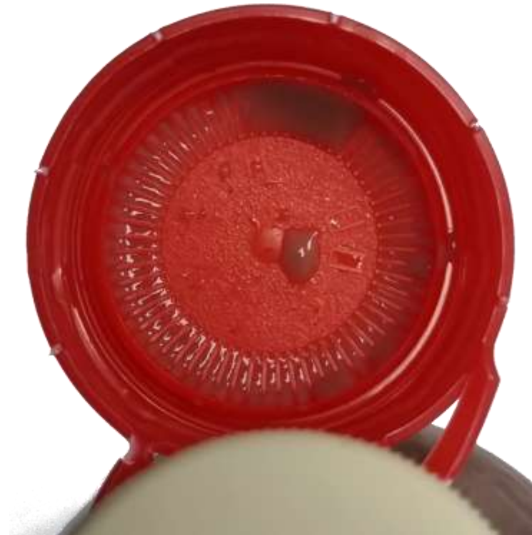
With capillary ribs and “frost” HP surface structure