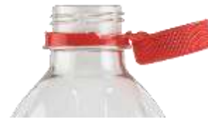
26 CSD, GME 30.40