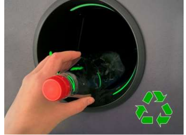
Consciously Protecting the Environment → joint collection bottle+cap