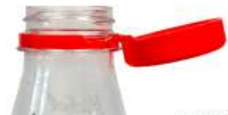
PET 38 2-start, GME 30.29