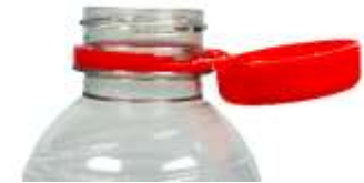
PET 33/15, GME 30.36