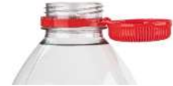
PET 29/25, GME 30.26