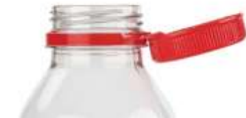
PET 38 3-start, GME 30.25