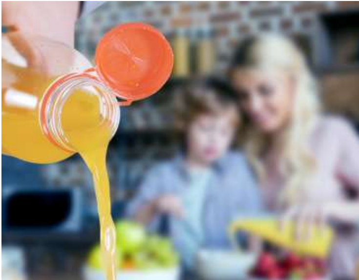
Convenient Pouring at Home → no more caps on the floor

This innovative sustainable packaging solution improves the handling: bottle opening, drinking and pouring as well as the re-closing become more comfortable. Wherever the consumer might be.